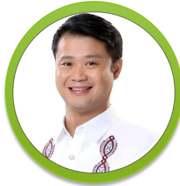
Sen. Sherwin Gatchalian Chair, Senate Energy Committee