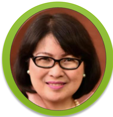
USec. Rafaelita Aldaba Department of Trade and Industry